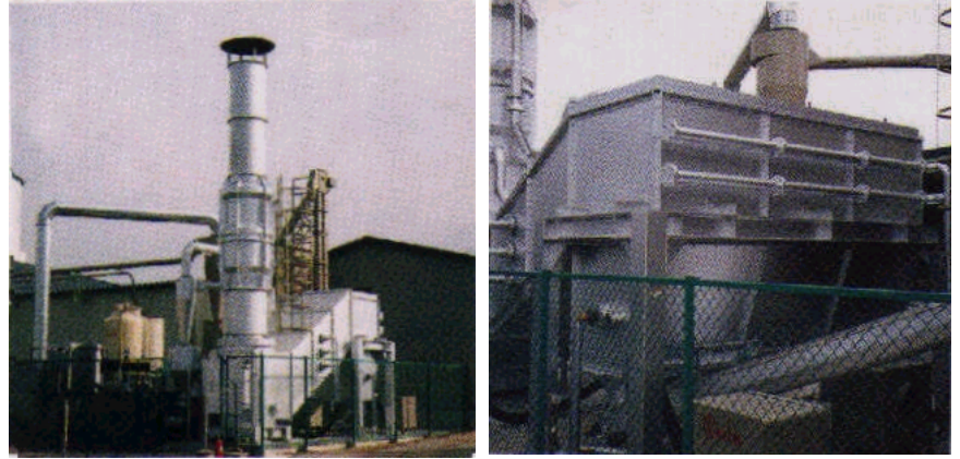
Outdoor Type W.C.C.

Subsequently, we Improved rice-husk carbonizer and completed wood-chip carbonizer in 1990. Our wood-chip carbonizer is improvement type of rice-husk carbonizer which is confident by long time achievements, and has many good features.