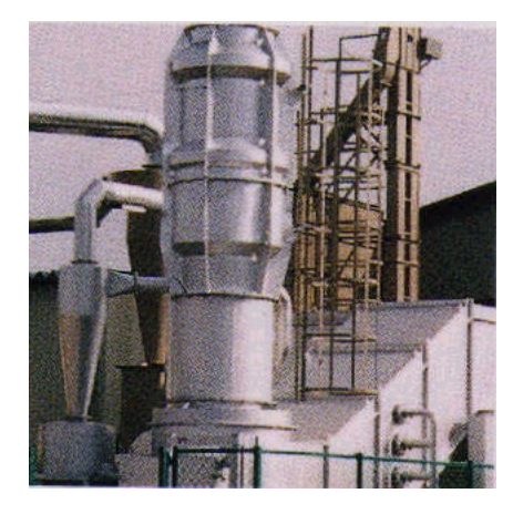
Dry type dust collector

The special automatic control system is applied so as to stop the operation by combination of motors. It works as a device of preventing troubles. A stout structure and excellent articles will bring no-trouble. Replacement of part, especially consumption parts, can be done easily.